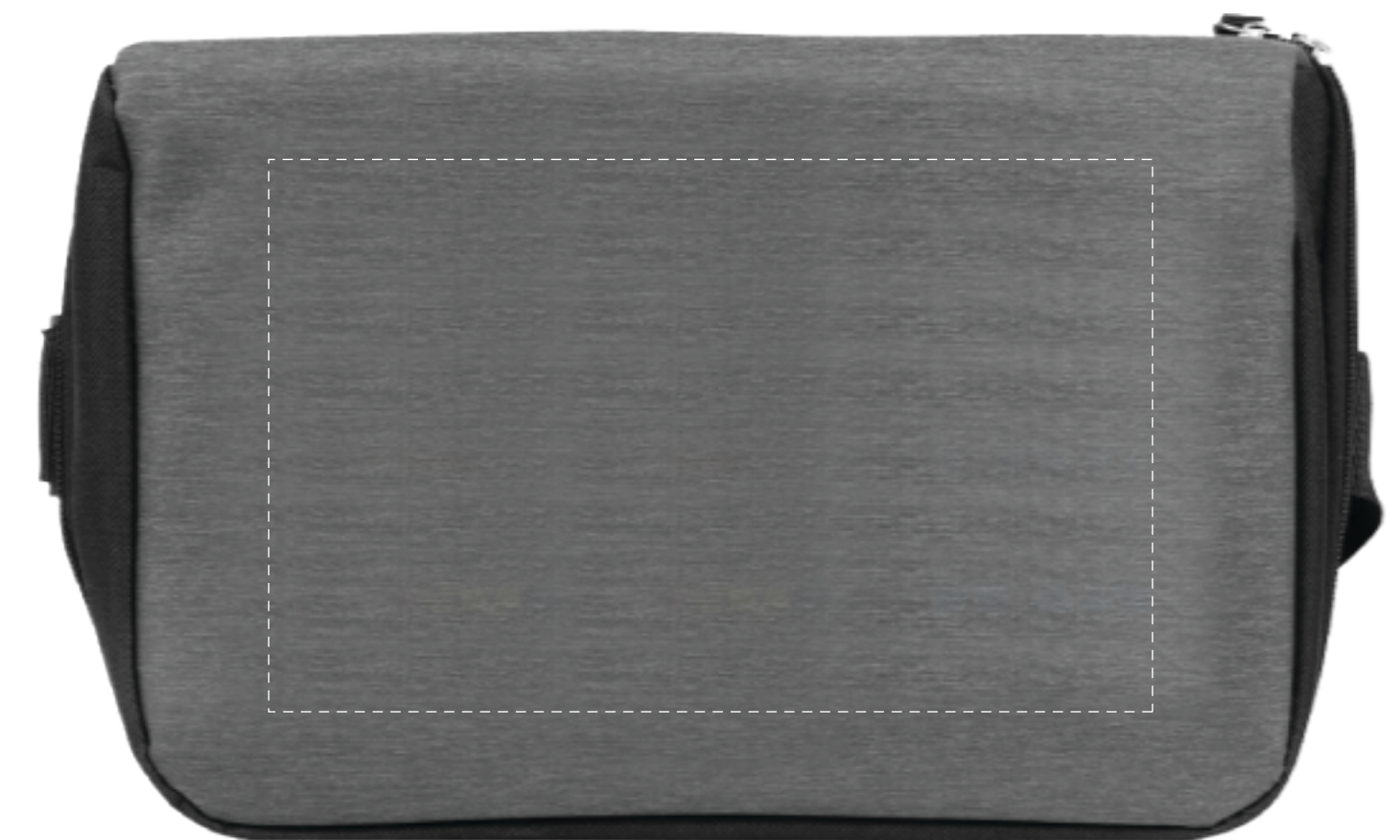
COMPOSITE NOT ACTUAL SIZE

Dashed Line For Imprint Area Only. Will Not Print.