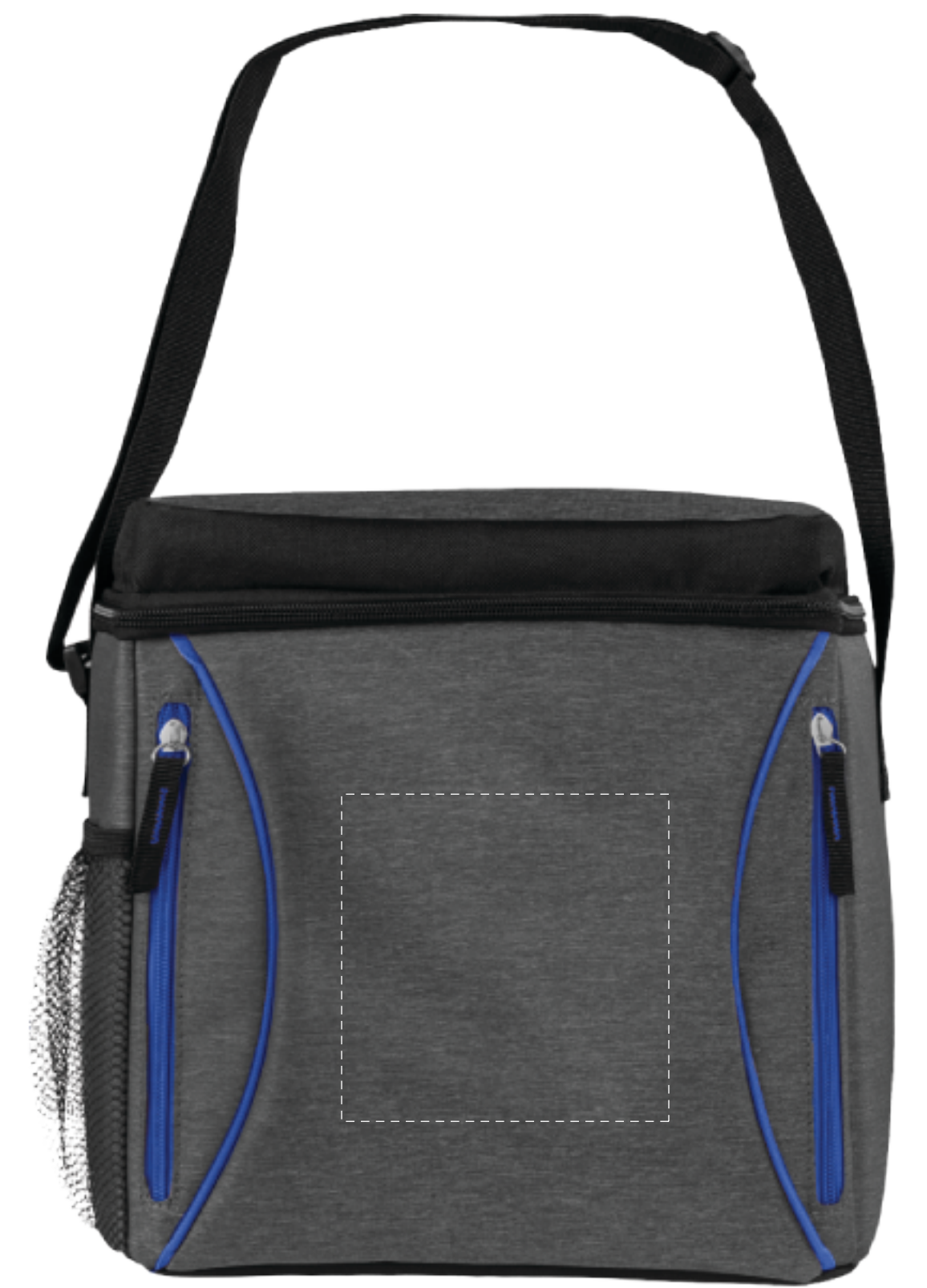
COMPOSITE NOT ACTUAL SIZE

Dashed Line For Imprint Area Only. Will Not Print.